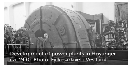
Development of power plants in Høyanger ca. 1930.