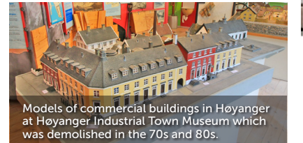
Models of commercial buildings in Høyanger at Høyanger Industrial Town Museum which was demolished in the 70s and 80s.

The steep mountains and the many lakes surrounding Høyanger is ideal for hydropower, and it was these natural conditions which drew the industrial developers to the village. Power production is the nerve and basis of life in Høyanger even today, and you can see it in all aspects of history and culture in the small town.